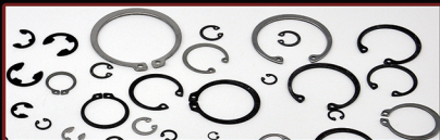
RETAINING RINGS& CIRCLIPS